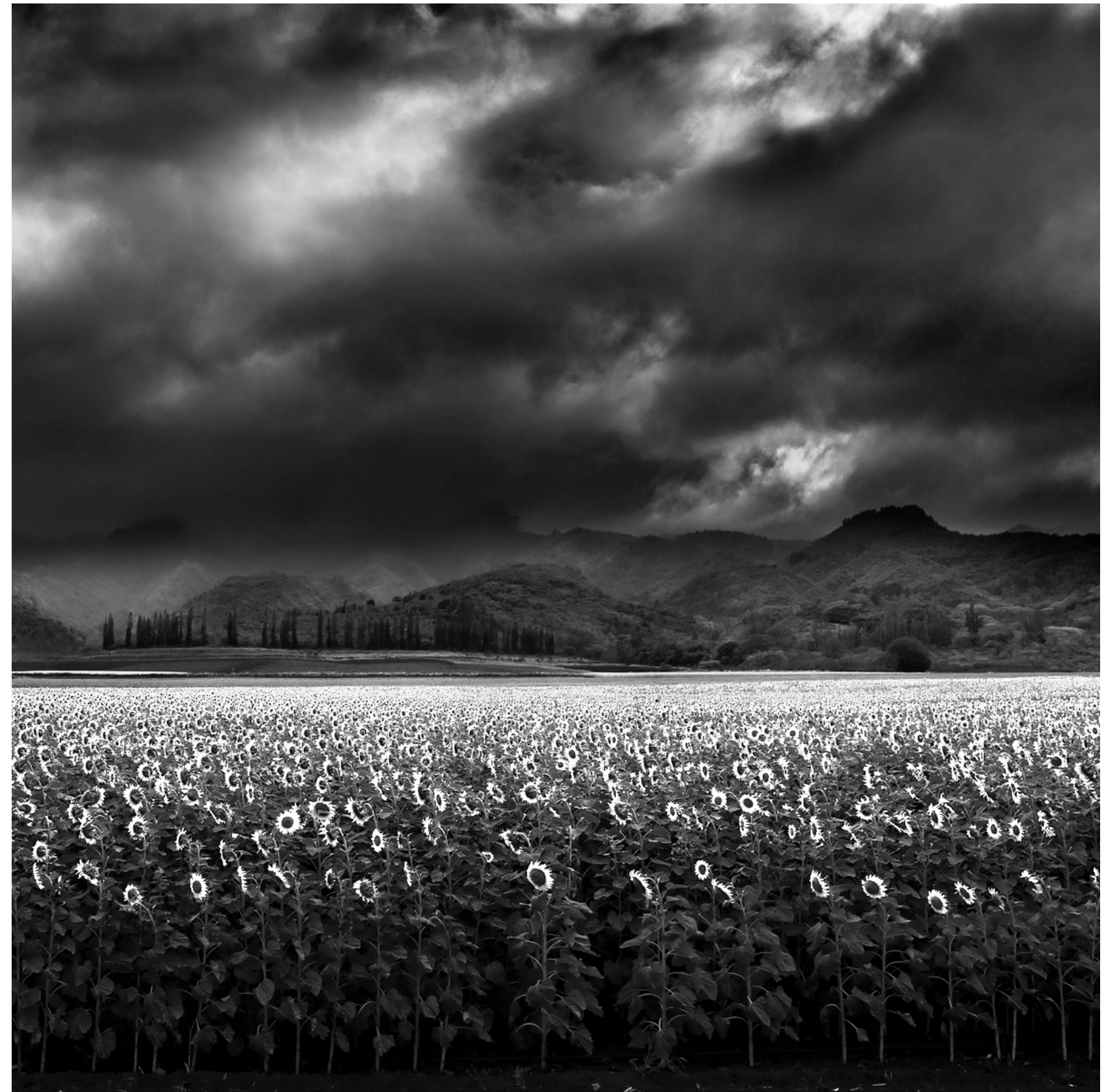
1st Place at Camera Obscura Journal