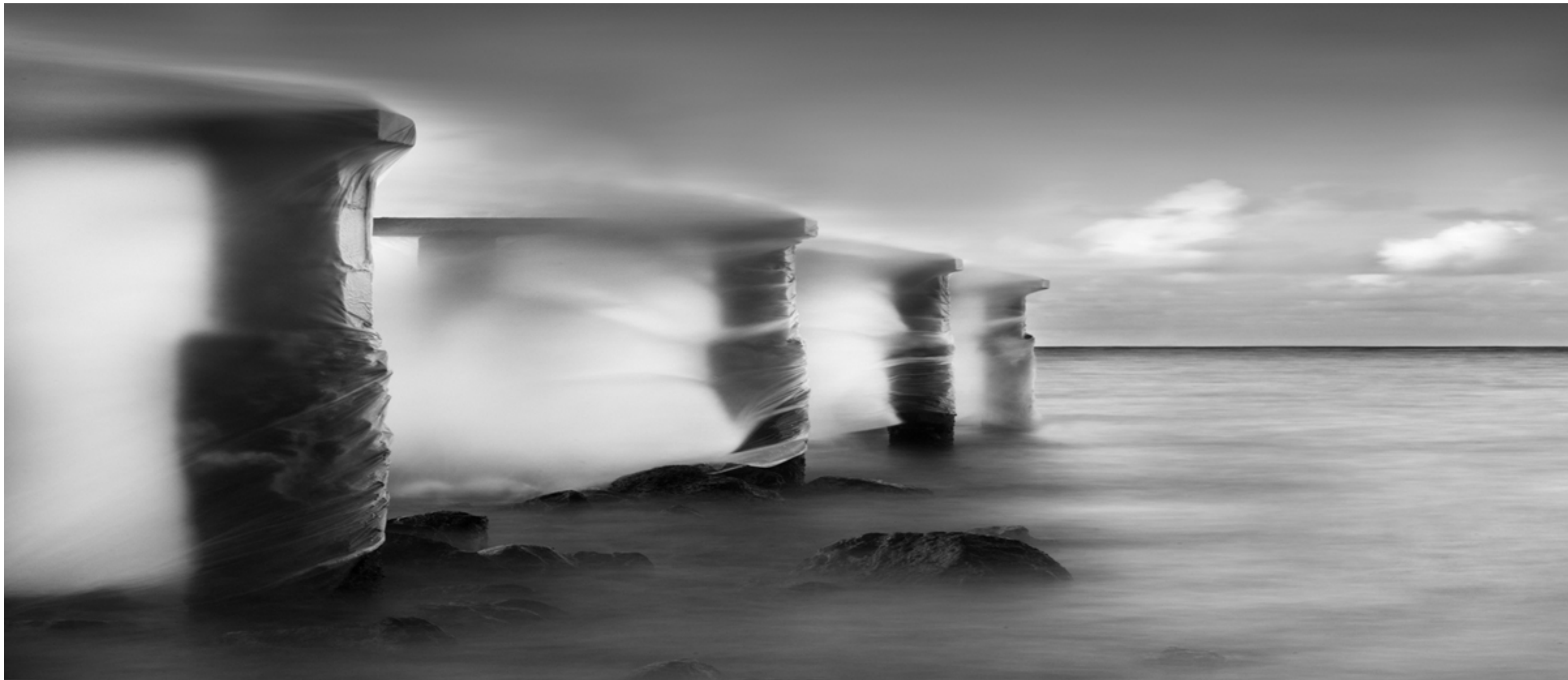
Gold Winner Prix de la Photographie Paris