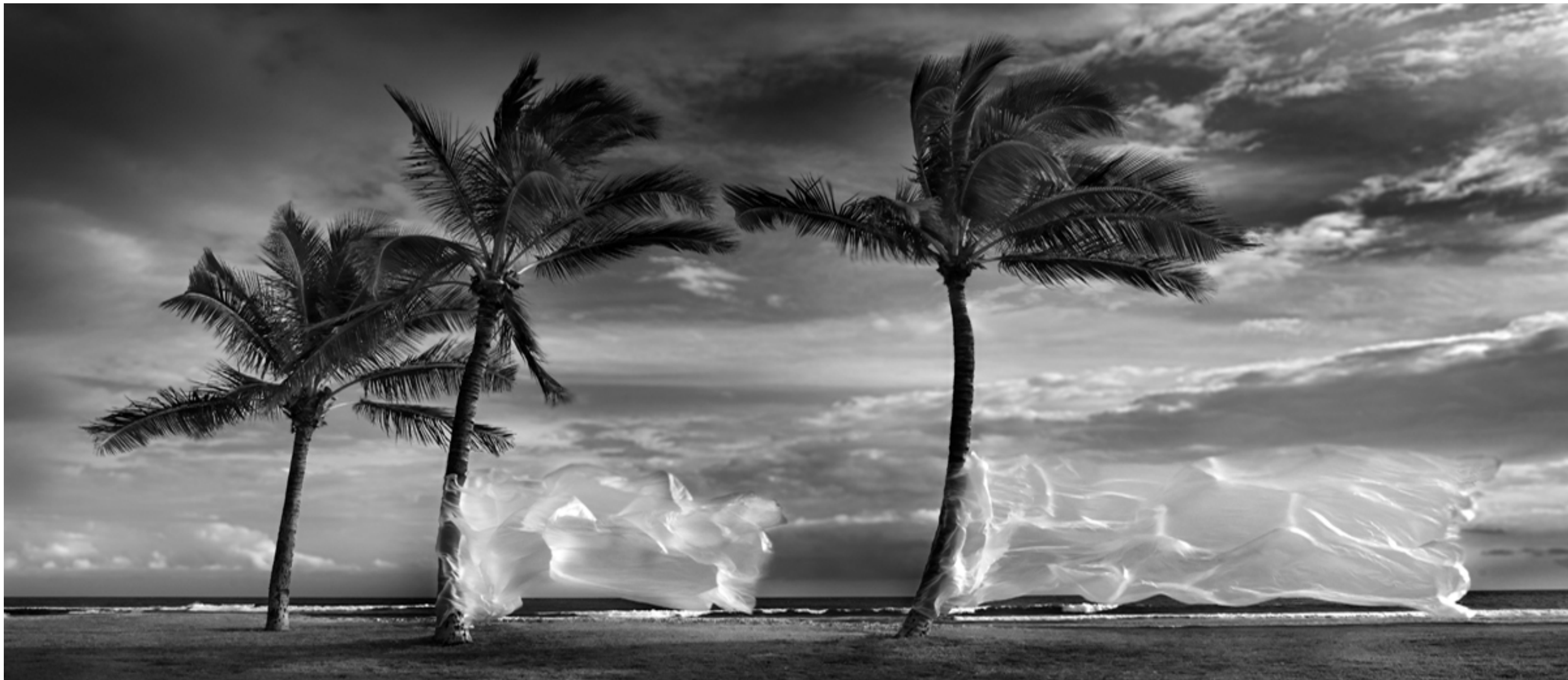
1st Place Juror Award at Contemporary Photography Hawaii