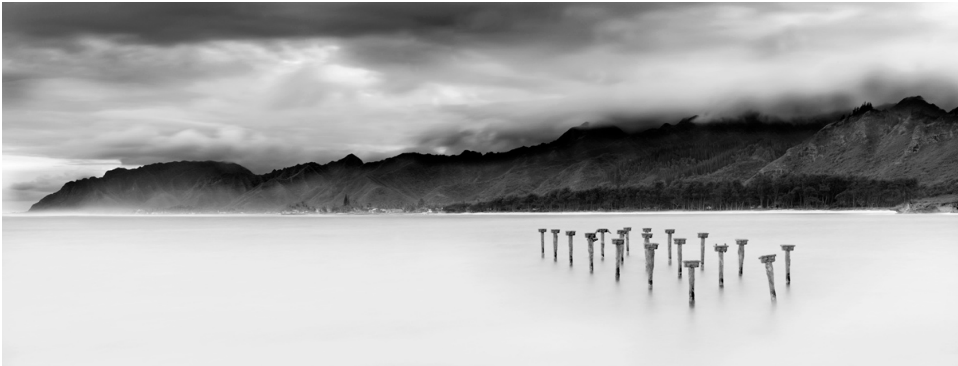
1st Place at PHOTOSPIVA